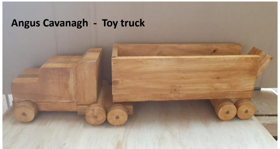
Angus Cavanagh - Toy truck