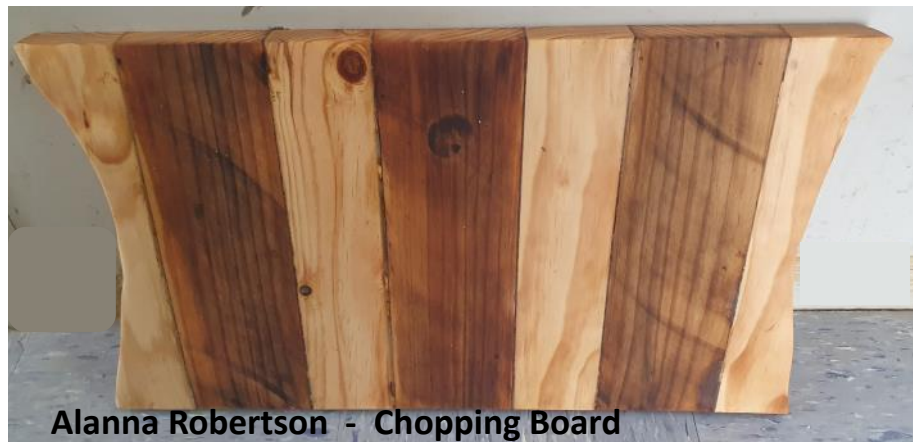
Alanna Robertson - Chopping Board

Students in Design Tech have made the most of their time back in the classroom producing a variety of items. Here are three examples of their creativity.